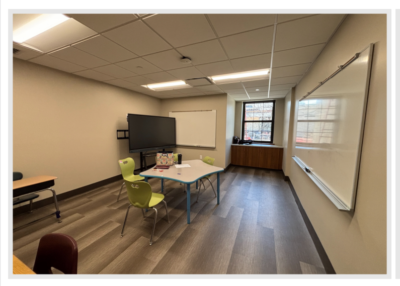
A look at the recently finished First-Floor Math Intervention Room. Phase 5 rooms are looking great as students and staff move in!