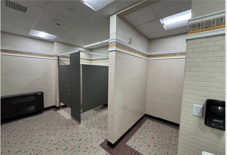
Renovation complete in the First-Floor Boys Restroom from Phase 5. Looking forward to finishing the remaining restrooms in Phases 6 & 7!